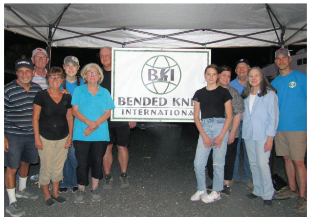
BKI Mission team