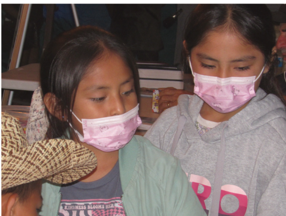
Masks were still common